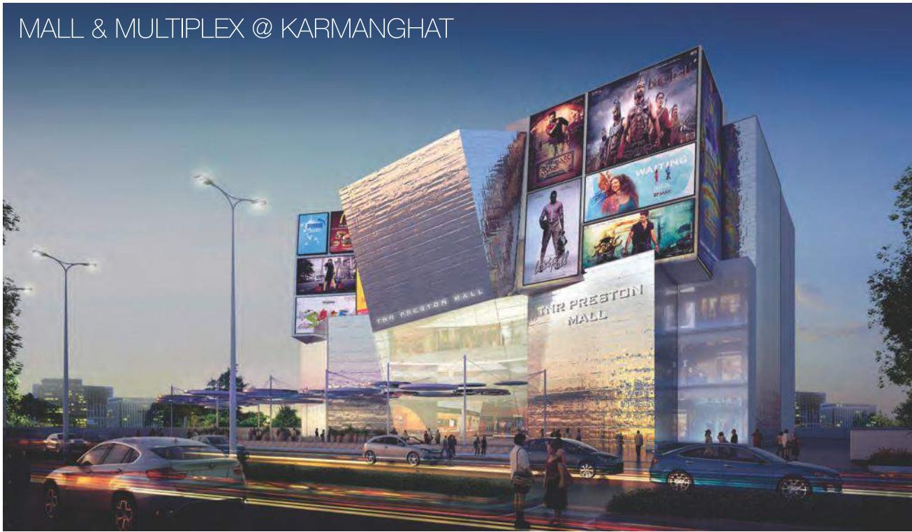
MALL & MULTIPLEX @ KARMANGHAT